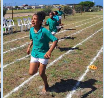
Our learners competing in our annual athletics day

On the 29 th of February, we started our annual athletics. Day 1 consisted of the Class 4 to Class 9 learners competing in our field events. These events are shotput, javelin, long jump, three sticks (triple jump) and discus. Each learner practiced for weeks ahead of the athletics day and on the day, they had 3 chances to achieve the best result. Day 2 was racing day. Kindergarten and Grade R started with wheelbarrow races. Class 1 to 9 then did 100m sprints. The final races consisted of the intermediate phase and senior phase running long distance races.