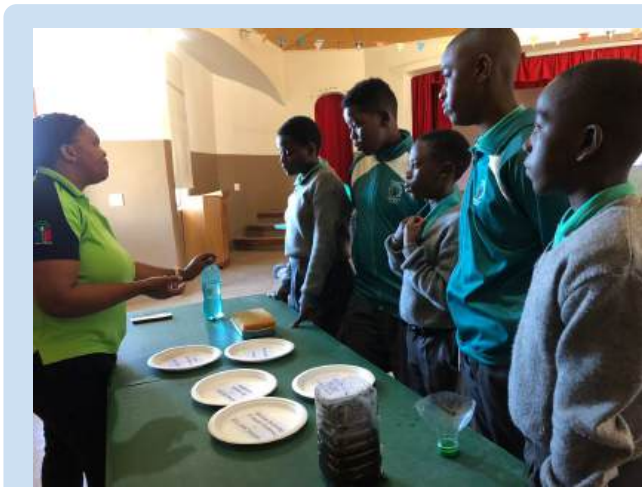
Whale Coast Conservation teaching Class 6 about wetlands and peatlands