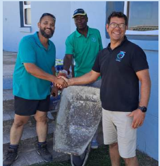
Learners enjoying Energade generously donated by LL Worx construction company. Thank you for your kindness, sir!