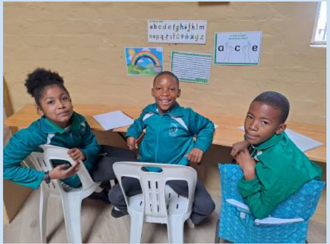
Class 5 enjoying some time in the library reading and learning.