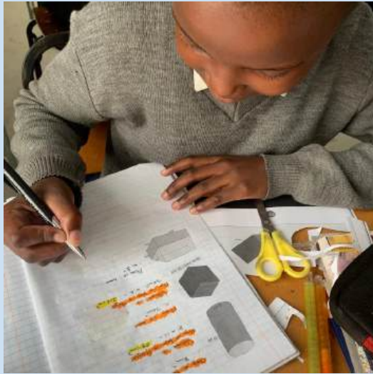
Geometry lesson, using shapes.