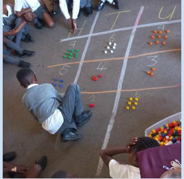
Learning place value on the carpet using blocks

We are looking forward to our Festival of Light where we will celebrate the winter and how we can warm our hearts with song, dance and lanterns we make during arts and crafts. We hope you enjoy our performance!