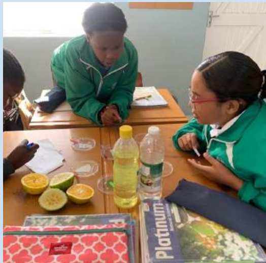
Learning about acids and bases is easy when you do it practically.