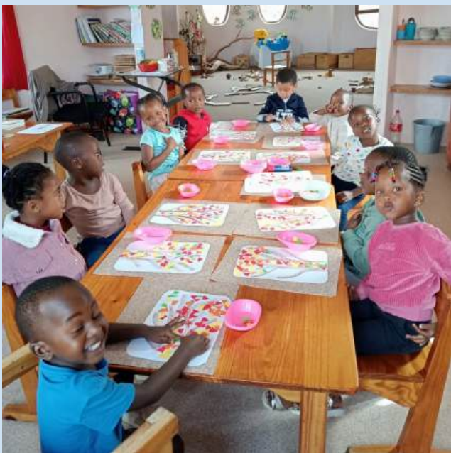
Creating autumn trees using orange, red, yellow and green paper.

“Play is our brain’s favorite way of learning.” – Diane Ackerman