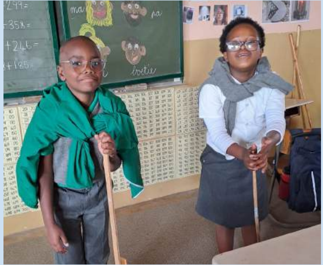
Acting out 'ouma' and 'oupa' in Afrikaans

In Class 3, we have been learning all about the Old Testament Stories, our favourite being the story of Noah's Ark and Joseph. We use our stories to learn English concepts like phonics, punctuation, sentence construction, reading comprehension and parts of speech. We have also learned all sorts of mathematical concepts like measurement, time, money and long multiplication. By far our favourite lessons were the lessons about gardening, creating our own compost and planting vegetables.