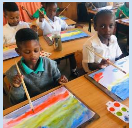
Painting the Autumn sunset to celebrate the changing of the seasons.