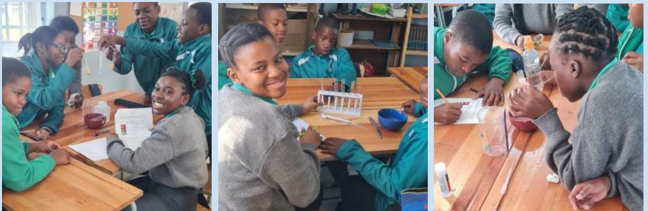
Class 8 doing science experiments in class. They have been delving deeper and deeper into science.

Our class got an opportunity to be part of the robotics club hosted by SANSA and will compete with other schools in a project competition. We also had a mini tour around Hermanus focusing on mountains and rivers. This gave us a practical experience to witness what we had learnt in class. Our class is really enjoying all the learning and we are looking forward to spending more years together in our academic journey."