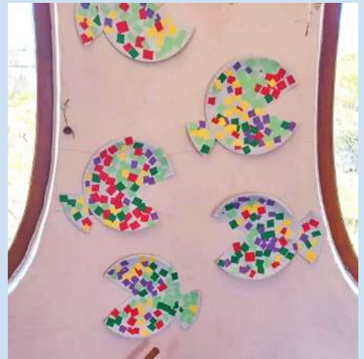
Cutting, sticking and showing off their fish for arts and crafts.

“Play is our brain’s favorite way of learning.” – Diane Ackerman